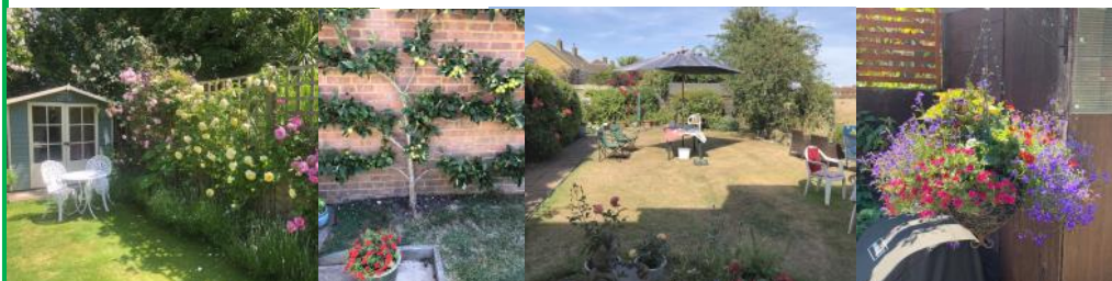
A selection of previous year's entries are shown above

Rosemary Wickens, 86 Front Street, Slip End or e-mail rosemary@kididee.plus.com