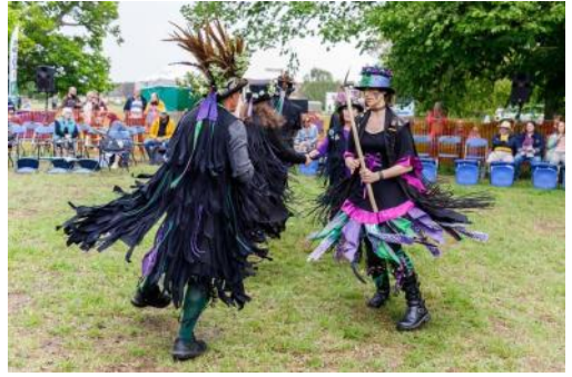
Hemlock Morris Dancers will be at Village Day